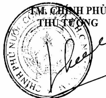
Nguyễn Xuân Phúc